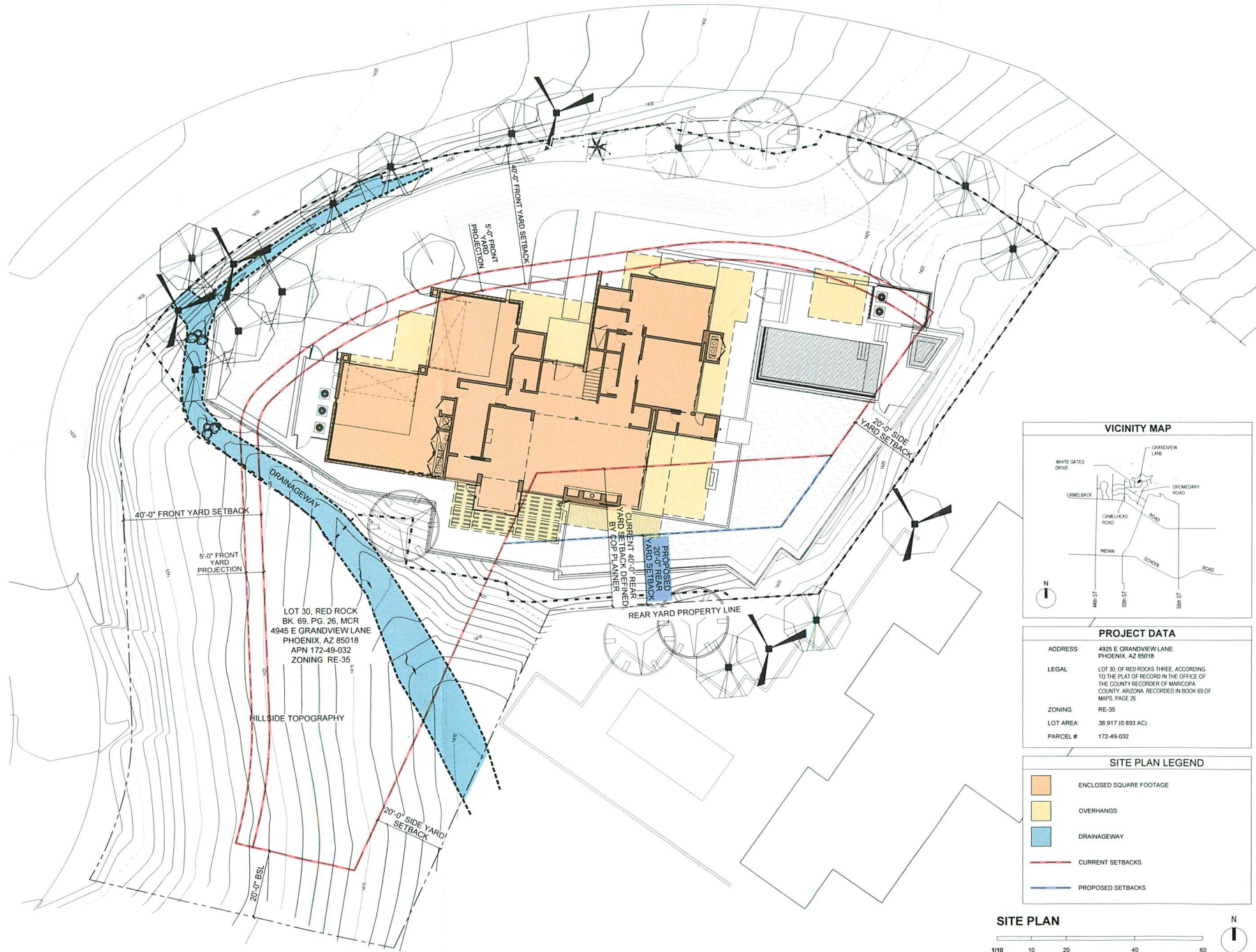
EXHIBIT 1-CURRENT AND PROPOSED YARDS WITH SETBACKS